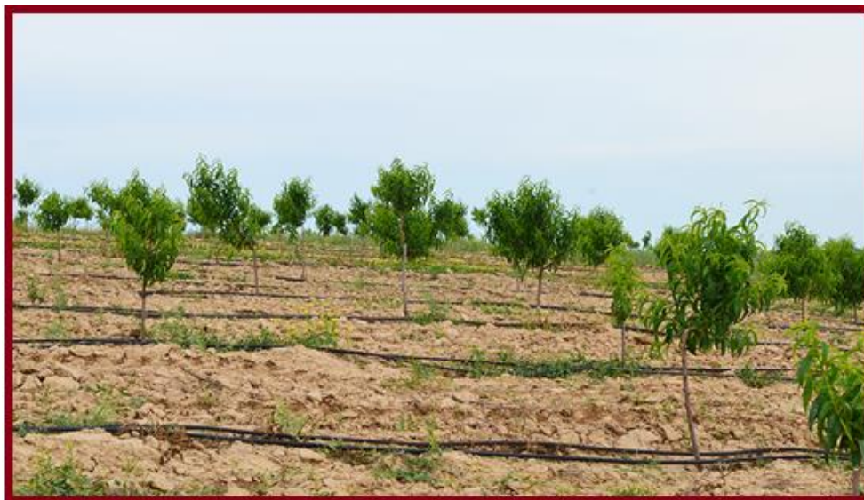
Fig. 3: Demonstration of the micro-irrigation regime using drip irrigation of fruit trees in the conditions of the EIA of the Research Institute of Erosion and Irrigation in the Shamakhi district in the village of Malkham.

The discharge was 20-30%, which led to uneven moistening. At the beginning of vegetation due