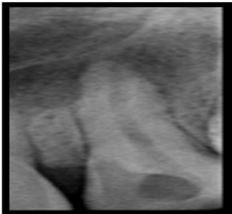
Figure 1: Pre-operative CBCT and IOPAR

Access cavity was prepared under local anaesthesia and rubber dam isolation. Working length was determined using radiograph . Biomechanical preparation was done upto 70 K file. Copious irrigation was done using 3% NaOCl and 17% ethylenediaminetetraacetic acid. Triple antibiotic was prepared by mixing equal proportions of metronidazole, ciprofloxacin and minocycline (Figure 2) . This antibiotic mixture was placed into the canals using a lentulo spiral up to the canal orifice. A cotton pellet was placed inside the pulp chamber and access cavity was sealed with Cavit .