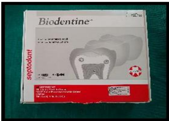
Figure 4: Biodentine

The membrane was placed in the pulp chamber and pushed apically with the help of endodontic pluggers below the level of cementoenamel junction. Biodentine (Septodont, France) was placed directly over the fibrin clot and the remainder of the cavity was sealed with composite restoration (Figure 4)