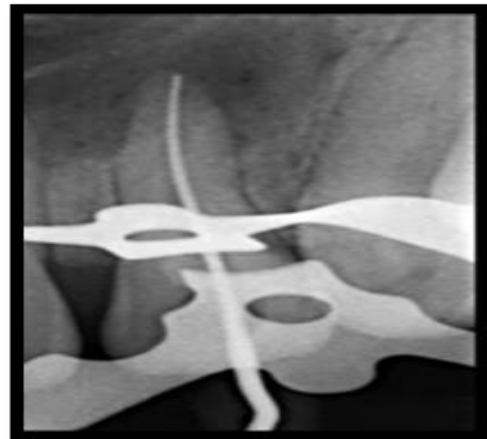
Figure 2: Working length determination and placement of triple antibiotic paste

Access cavity was prepared under local anaesthesia and rubber dam isolation. Working length was determined using radiograph . Biomechanical preparation was done upto 70 K file. Copious irrigation was done using 3% NaOCl and 17% ethylenediaminetetraacetic acid. Triple antibiotic was prepared by mixing equal proportions of metronidazole, ciprofloxacin and minocycline (Figure 2) . This antibiotic mixture was placed into the canals using a lentulo spiral up to the canal orifice. A cotton pellet was placed inside the pulp chamber and access cavity was sealed with Cavit .