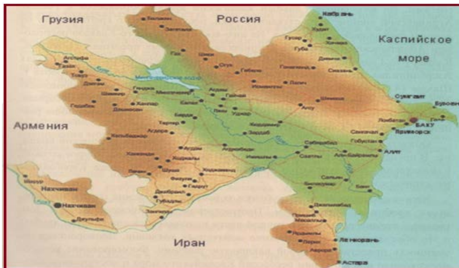
Fig.2: Map of research objects on the study of erosion hazard of soils in Azerbaijan

Square of the Republic of Azerbaijan-86.6 thousand km 2 , the population (January 1, 2018)-over 10.0 million man. Azerbaijan is situated on the western shore of the Caspian Sea. The length of the coast of the Caspian Sea in Azerbaijan is 713 km. Azerbaijan is an important transportation hub of Commerce and of the "Great Silk Road".