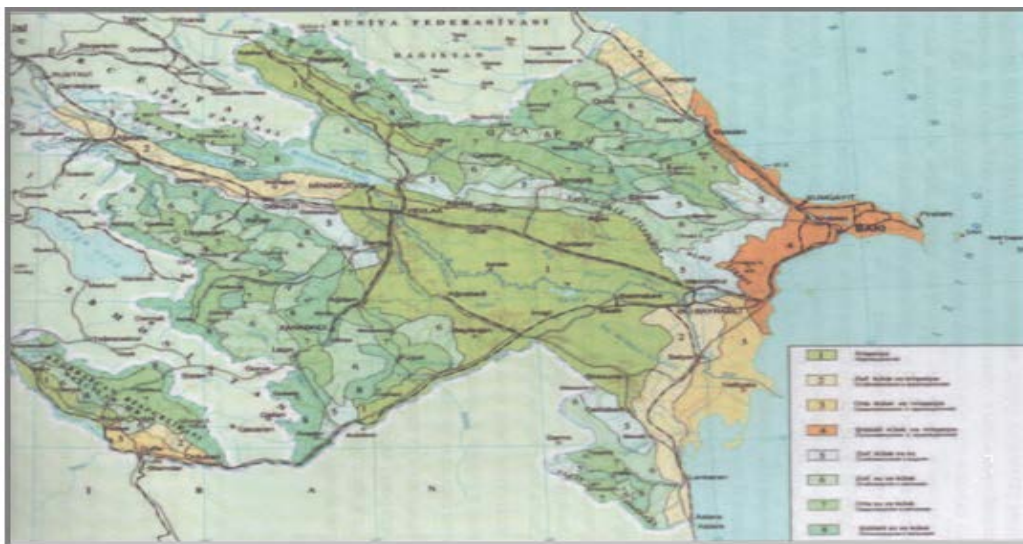
Fig. 2: Soil Erosion Map of Azerbaijan.

Flush the soil on the Caucasus when steep slopes reach for the year 50–300 t/ha. The growth rate of ravines in Azerbaijani territory in the mountainous area reaches 3–5 m, while in the foothill zone-5-10 m for the year. The mountain zone is characterized by the development of data of ravines.