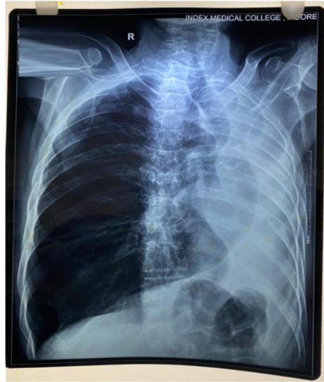
Figure 2: CHEST XRAY (FIBROSIS & ATELECTASIS)

When TB heals either AFB Positive or AFB Negative but it always leaves its footprints in the form of extensive fibrosis, traction bronchiectasis, lung volume loss/collapse and cavitory lesion[3&4].