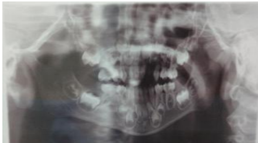
Figure 2: panoramic photo of jaw

calculus in all regions. Odontogram showed tooth roots 51,52, 61, 62, media caries 54,55, 74, and tooth pulp necrosis 85. The patient's mouth opened about 2.5 cm. Routine blood laboratory examinations showed an increase in the number of white blood cells by 24,480 mm 3 and platelets by 476,000 mm 3 and a decrease in the levels of Serum Glutamic Pyruvic Transaminase (SGPT) 9 U/L and creatinine 0.42 mg/dL