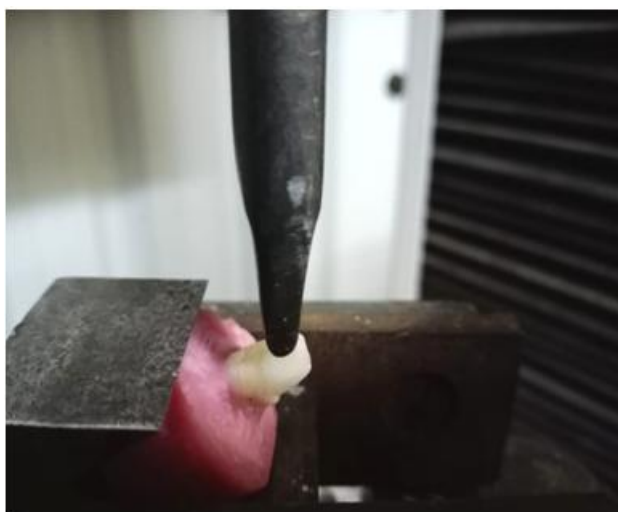
Figure 1: Sample mounted under the universal testing machine by using a custom-made metallic Jig and tested for fracture resistance

Parapost [Coltene Whaledent] is a cylindrical, conical type of post that consists of unidirectional glass fibres embedded in epoxy resin matrix. The fibre diameter ranges from 8.83µm to 16.97 µm and the fibres/matrix ratio were